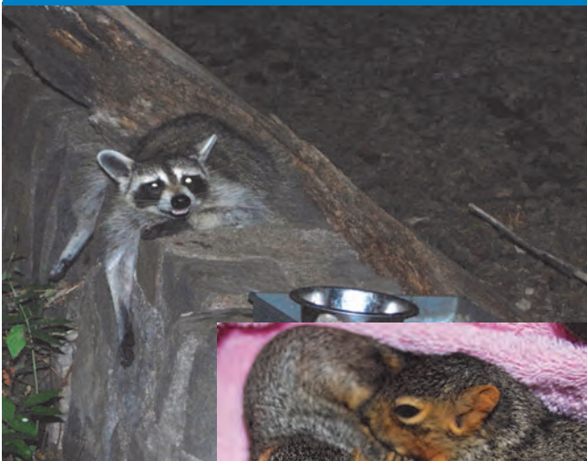
A raccoon suffering heat exhaustion and three motherless squirrels find relief at Bat World.